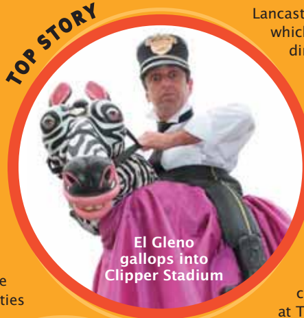
El Gleno gallops into Clipper Stadium