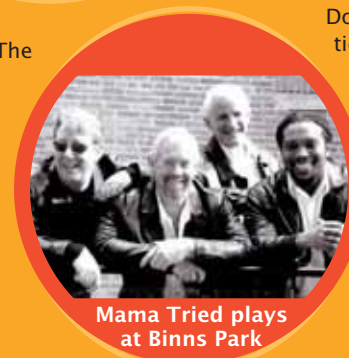
Mama Tried plays at Binns Park

Lancaster Marriott at Penn Square, which offers a package including dinner for two, champagne and a breakfast buffet. The Lancaster Arts Hotel offers a package including overnight accommodations, hats and noisemakers, admission to 3...2...1! Lancaster, a bottle of champagne, dinner for two at John J. Jeffries Restaurant and a continental breakfast.